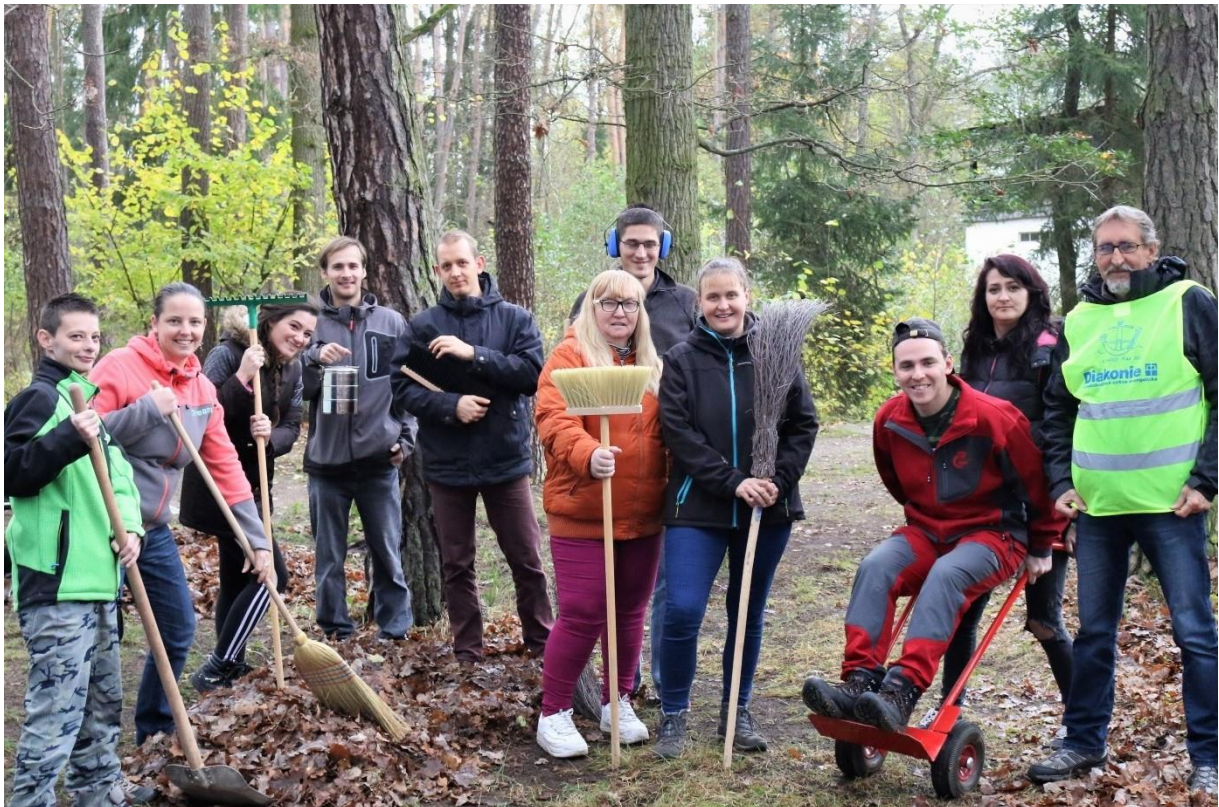
Volunteer training in Běleč nad Sázavou.

Every time the Czech Republic has been hit by floods since 1997, Diaconia was there to help. It is one of the Center's most important missions to ensure that Diaconia is ready to provide immediate professional assistance any time a flood comes – sending volunteers to the affected regions, lending out equipment and material and providing psychosocial care to the victims. We operate five humanitarian aid warehouses, we regularly train volunteers among Diaconia employees as well as the public, and we also participate in humanitarian panels in several regions in the Czech Republic, which coordinate the help provided by non-profit organizations and the integrated emergency services. To learn more about our flood assistance please go to www.povodne.diakonie.cz .