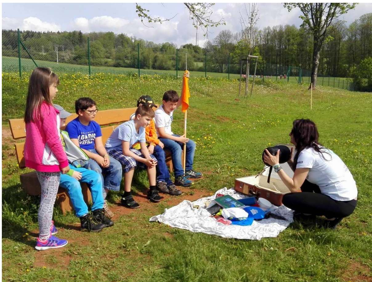
A project day at a primary school – showing an emergency evacuation kit.

Natural disasters cannot be avoided, yet we can minimize their consequences. Resilient Municipality is Diaconia's project that helps villages to get ready for emergencies. In 2017 – 2019 we are working in four villages: Štětí, Rudník, Křešice and Plaňany. In 2017, we organized meetings with communities and local authorities in the villages, we led trainings for basic school teachers and project days for children, and we also provided education to communities introducing such farming methods and practices which are resilient to drought and floods. Other trainings focused on how to provide non-professional psychosocial help. In cooperation with ETF UK, we organized a conference called Resilience as a Decision, which was attended by 80 participants and 15 speakers including the mayors of the participating villages. We founded the project website at www.odolnaobec.cz .