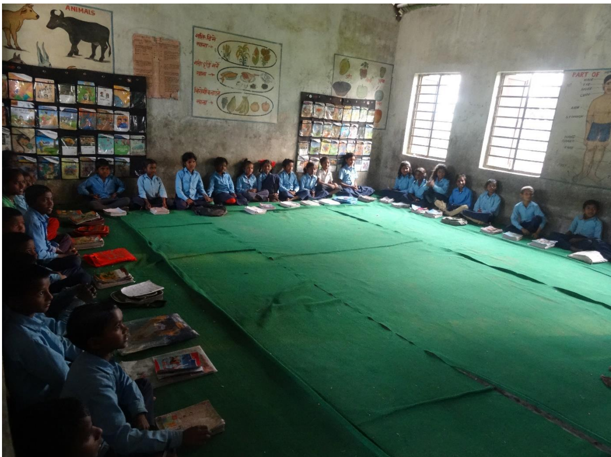
Our activities in Nepal.

Furthermore, as part of the Erasmus+ European Voluntary Service programme, the Center of Relief and Development sent a volunteer to the Angelus hospice in Moldova in 2017.