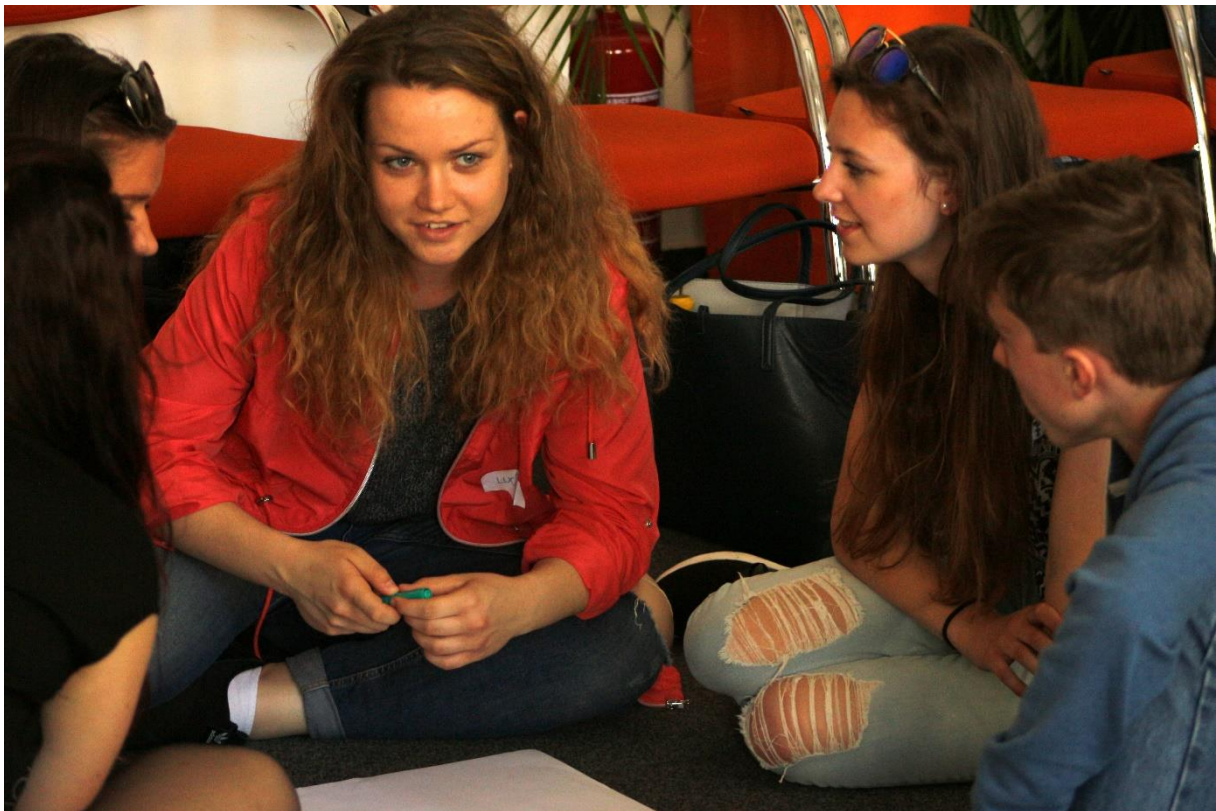
A workshop for secondary school students.

The project called Context – Global Problems Viewed by Each Individual - finished in 2017, having lasted for three years. Its aim was to support teachers in integrating the development principles and topics into their lessons at basic schools and to improve the children's as well as the public's awareness of global development issues. To round off the project, we organized a GDE round table for the wider public, which served as an opportunity to sum up the experience gained through the project and to discuss further support of GDE at Czech schools. To learn more go to www.ucimespolu.cz .